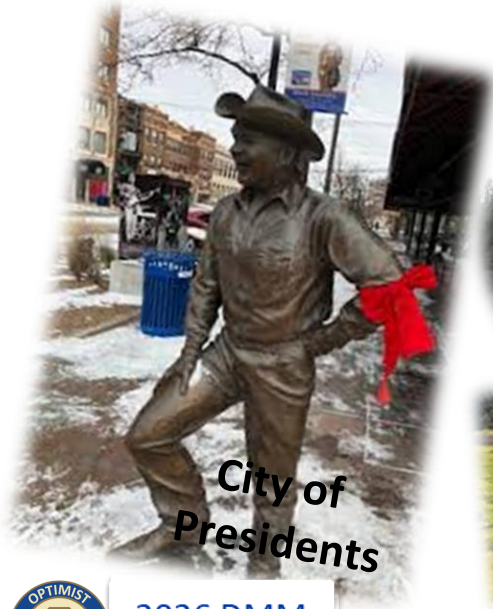
City of Presidents